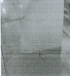
Damaged due to manual stripping